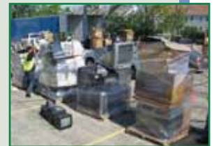
Electronics Recycling by eWorks Electronics Services