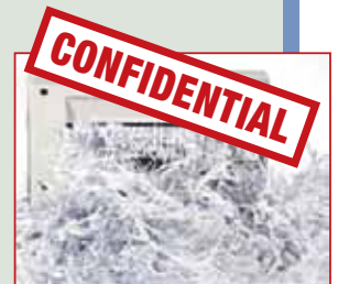
On-site document shredding truck