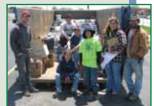
Latex Paint recycling by Earth Paint Collection Systems