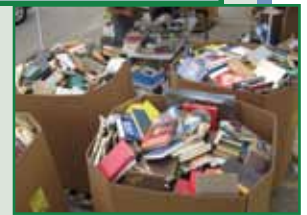
Book Recycling by Pacesetter Books

Please call 630-208-3841 or email recycle@countyofkane.org to sign up to be mailed a paper copy of the Guide each year.