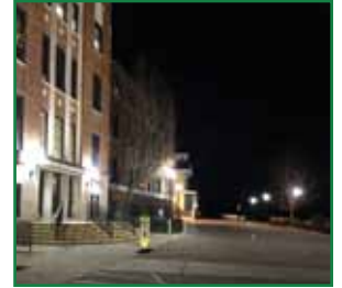
Upgrading to LED bulbs in the pole lights at the Kane County Government Center reduced the electricity consumption of those fixtures by over 75%.

Sustainability efforts stretch across all County government operations—including reducing energy and water consumption at the County's two dozen facilities, revising purchasing procedures and contracts to make a shift toward using more eco-friendly products and services, and taking steps to make the County's fleet of nearly 300 vehicles more fuel-efficient.