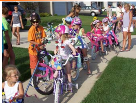
Nearly 50 Children from Georgian Place Subdivision participated in a National Night Out Bike Parade.

The "25 th Annual National Night Out" celebration was held on August 5 th and Huntley residents came out in full force!